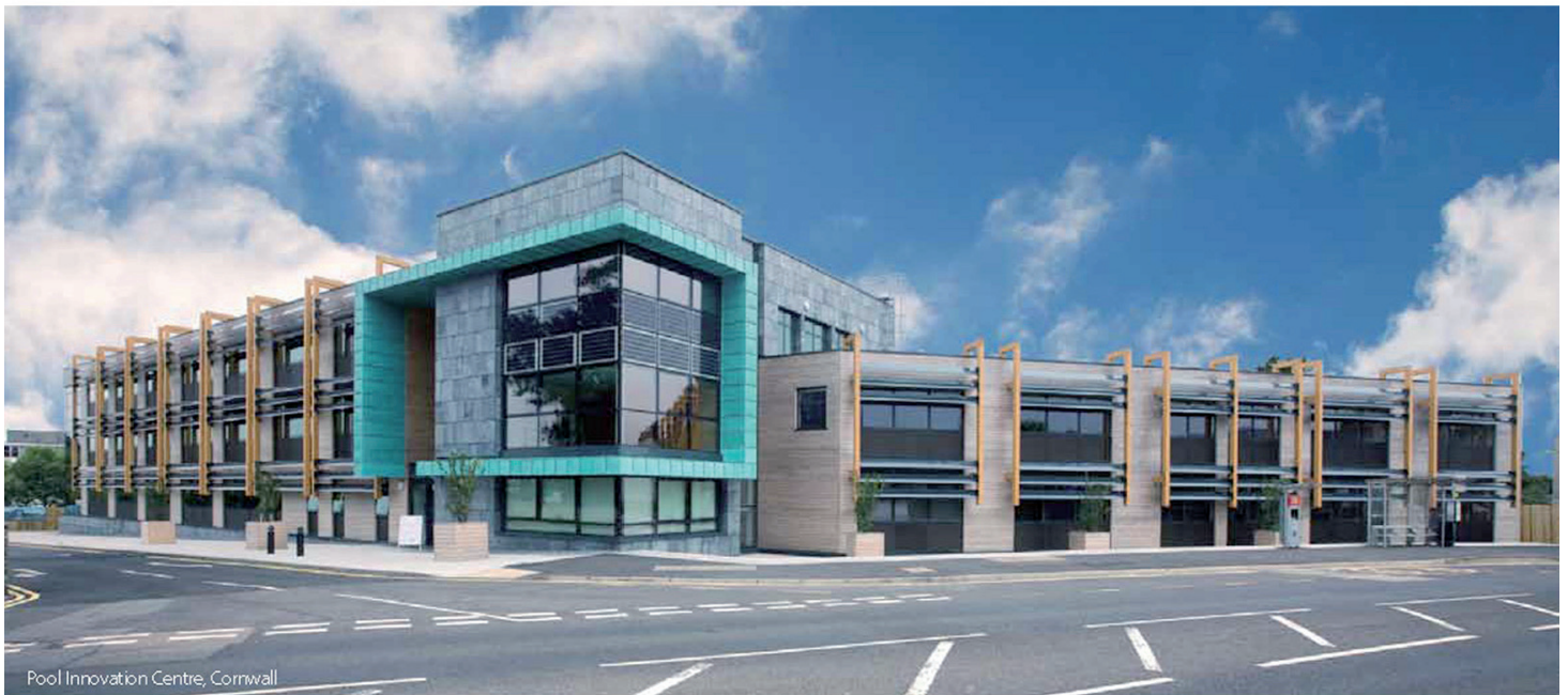
Pool Innovation Centre, Cornwall

More details are available from InvestinCornwall.